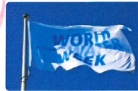
VIEW ORIGINAL IMAGE